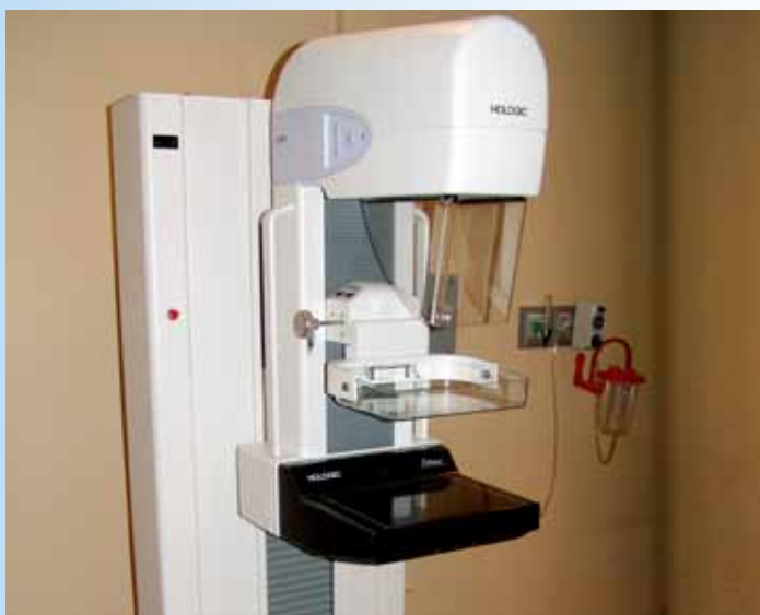
■ Digital Mammography produces diagnostic digital images of breast tissue using low-dose equipment.