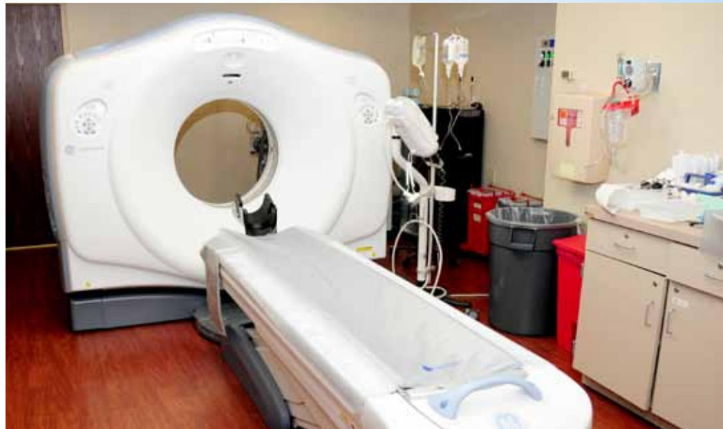
■ Computed Tomography (CT) is the use of a rotating X-ray unit to obtain image "slices" of anatomy at different levels within the body. A computer then stacks and assembles the individual slices, creating a diagnostic image that allows physicians to view the inside of organs.

Aultman Imaging Services is accredited by the American College of Radiology for MRI, CT, ultrasound, mammography and stereotactic biopsy. Learn more about radiology and Aultman's innovative technology.