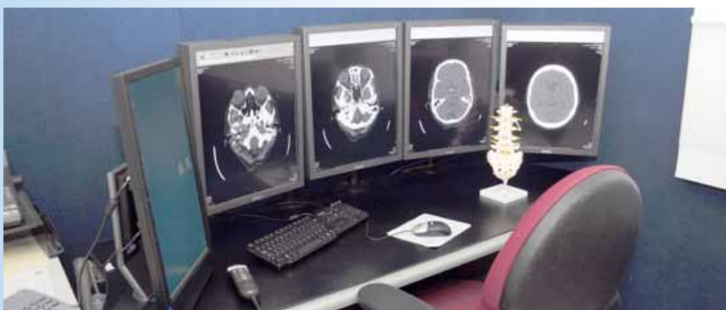
■ Radiology Information System/Picture Archiving and Communication System (RIS/PACS): RIS is a networked radiology software platform that stores, manipulates and distributes patient data. PACS is a Web-based radiology software platform that archives, retrieves, distributes and presents imaging studies for advanced visualization and primary interpretation. All images are crisp, digital images that can be sent anywhere.