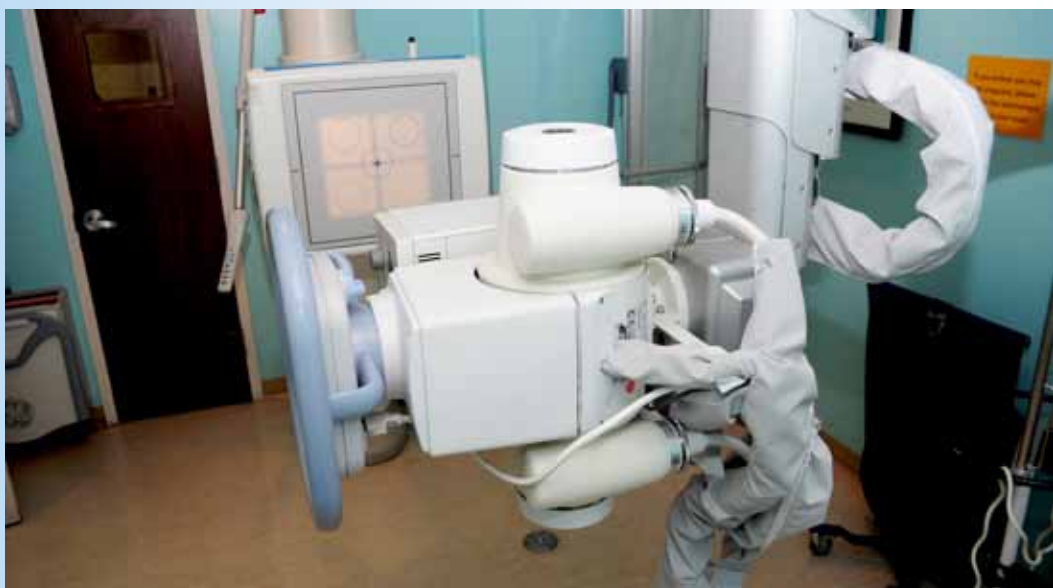
■ X-ray technology uses radiation to produce black and white images of anatomy. The images are captured on film, computer or videotape. X-rays detect bone fractures, find foreign objects in the body and demonstrate the relationship between bone and soft tissue. Bone densitometry uses a special type of X-ray equipment to measure bone mineral density at a specific site - usually the wrist, heel, spine or hip - or to calculate total body bone mineral content.