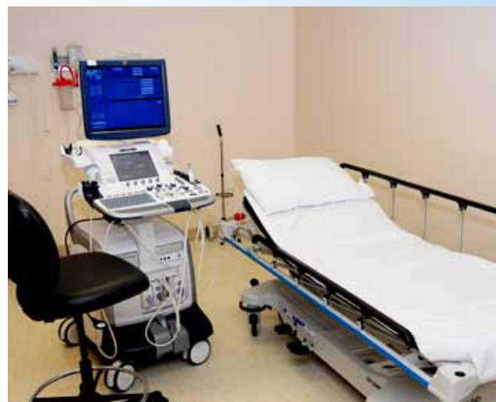
■ Ultrasound uses sound waves to obtain images of organs and tissues in the body. During an ultrasound examination, the sonographer places a transducer in contact with the patient's body. The transducer emits high-frequency sound waves that pass through the body, sending back "echoes" as they bounce off organs and tissues. Special computer equipment converts those echoes into visual data.