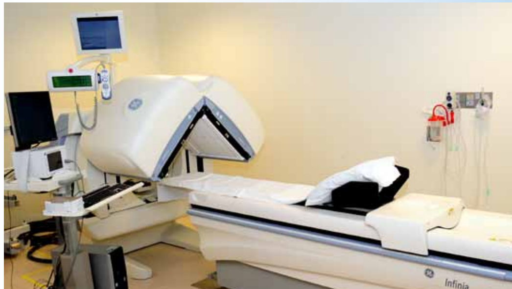
■ Single-Photon Emission Computer Tomography (SPECT) is a type of nuclear medicine exam in which gamma photon-emitting radionuclides are administered and then detected by gamma cameras rotated around the patient and combined with low-dose CT images, allowing for better anatomic visualization.