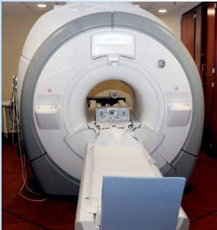
■ Magnetic Resonance Imaging (MRI) exposes the atoms in the patient's body to a strong magnetic field. A radiofrequency pulse is applied to the field, which knocks the atoms out of alignment until the pulse stops. In the process, the atoms give off signals that are measured by a computer and processed to create detailed images of the patient's anatomy. Aultman is the first hospital in Northeastern Ohio to have a Widebore MRI. It features a wider opening to increase comfort for larger and claustrophobic patients, along with faster scan times and improved image quality.