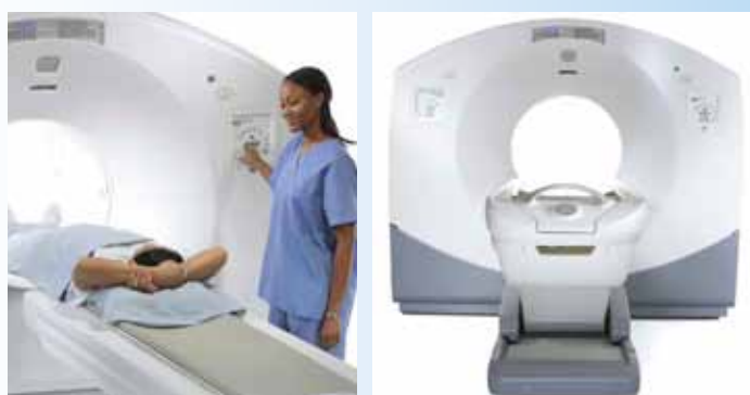
■ Nuclear Medicine is administering trace amounts of radiopharmaceuticals to a patient to obtain information about organs, tissues and bone. Positron Emission Tomography (PET/CT) is a nuclear medicine imaging tool that combines a PET scan and a CT scan. PET/CT scans allow clinicians to pinpoint the location of cancer within the body before making treatment recommendations. Aultman currently uses mobile PET/CT technology and will be installing a fixed unit in 2012.