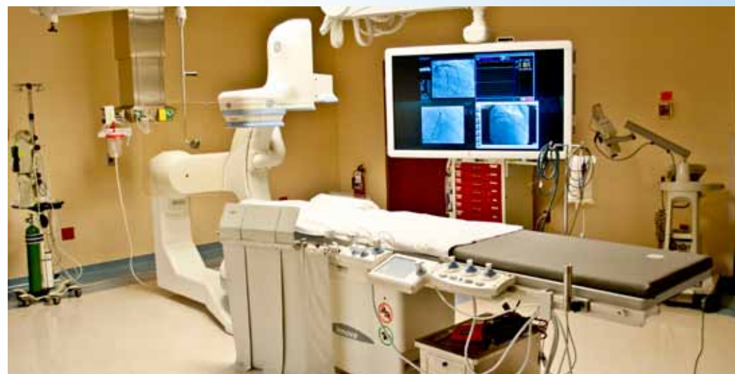
■ Cardiovascular Interventional Radiology is the use sophisticated imaging techniques to help guide catheters, vena cava filters, stents or other tools through the body. Using these techniques, disease can be treated without open surgery.